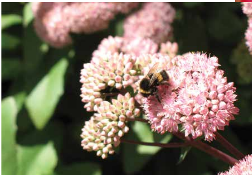
Pictured anti clockwise from top left: Penstemon CHA CHA Purple , Penstemon CHA CHA pink , Bumble Bee feeding , Penstemon 'Strawberry Taffy' showing distinctive Nectar Guide patteration.

PROUDLY GROWN BY LIVING FASHION PERENNIALS WWW.LIVINGFASHION.CO.NZ